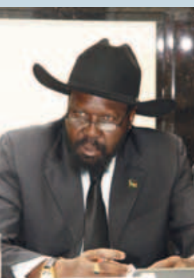
Salva Kiir, President of Southern Sudan, at an FES Brussels event on future political scenarios in Sudan.

In the framework of its Common Security and Defence Policy, the EU increasingly takes part in peace missions contributing to crisis prevention and conflict management in third countries. The FES in Brussels complements this commitment by offering forums for political and civil society actors from the disputing parties and representatives of the EU to develop conflict management strategies.