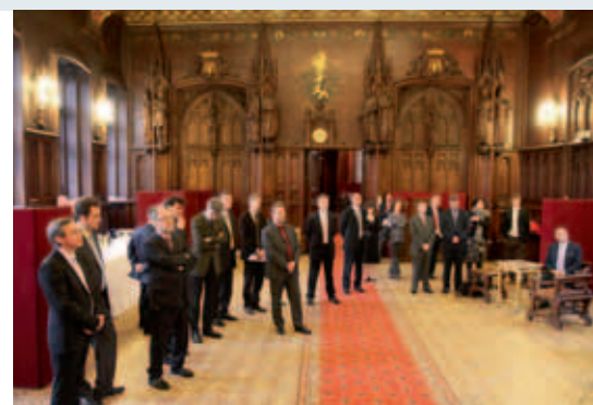
The opening of the 8th EU-Russia Round Table held by the FES in Brussels Town Hall, the first held in the EU capital.

The EU maintains a network of bilateral strategic partnerships with global actors such as the USA, Russia, China, India, South Africa and Brazil in order to form alliances to tackle global challenges such as climate change. The FES in Brussels supports the substance and framework of these partnerships.