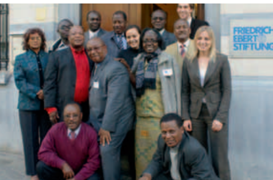
A delegation of trade union, parliamentary and private sector representatives from Ghana, Ivory Coast and Ethiopia learn about the EPA negotiation process.

The EU cooperates worldwide with regional organisations such as MERCOSUR and ASEAN. Since 2002, the EU has also negotiated Economic Partnership Agreements (EPAs) with the ACP countries in six regional groups, based on the Cotonou Agreement. The negotiation process takes place primarily at intergovernmental level. The FES in Brussels therefore promotes the involvement of non-state actors in the dialogue between the negotiating parties.