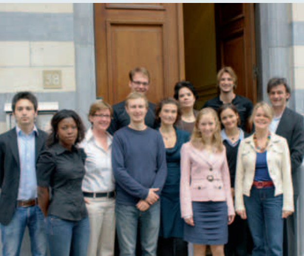
The FES team in front of the EU Office in the European Quarter of Brussels

The EU Office of the Friedrich-Ebert-Stiftung (FES), with its headquarters in Brussels and activities in Brussels and Strasbourg, was opened in 1973.