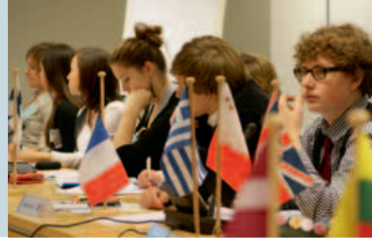
School journalists in a simulation about the European Cosmetics Directive.

Fewer and fewer people – particularly young people – feel motivated to participate in European elections and generally to help shape Europe. The press has an important role to play in reducing widespread euroscepticism and bringing European citizens closer to Europe. In this respect, the FES in Brussels organises regular seminars for school journalists presenting the basics of European press work.