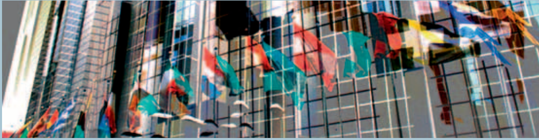
EU OFFICE, BRUSSELS