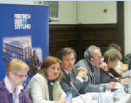
Conference on social housing in the EU, organised by the FES Brussels and the International Union of Tenants.

After more than sixty years of peace, citizens in the European Union take peace, security and freedom for granted. The economic and monetary union with the euro as mainstay of European identity is also no longer enough to fuel enthusiasm for Europe. Europe needs a soul: a political and social union in cultural diversity and a sound environment. For this reason, the FES in Brussels primarily promotes strengthening social Europe, which includes decent, affordable and suitable housing.